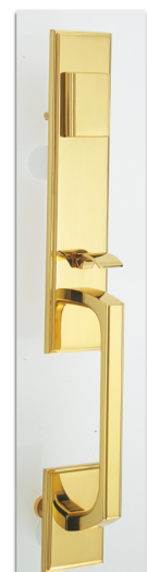
Optional finish in Polished brass